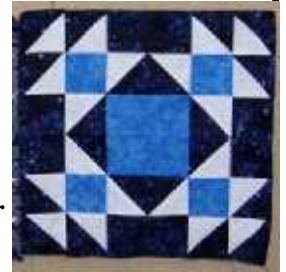
Pieced Crystals Block