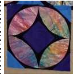
Appliqué Indiana Circle Block