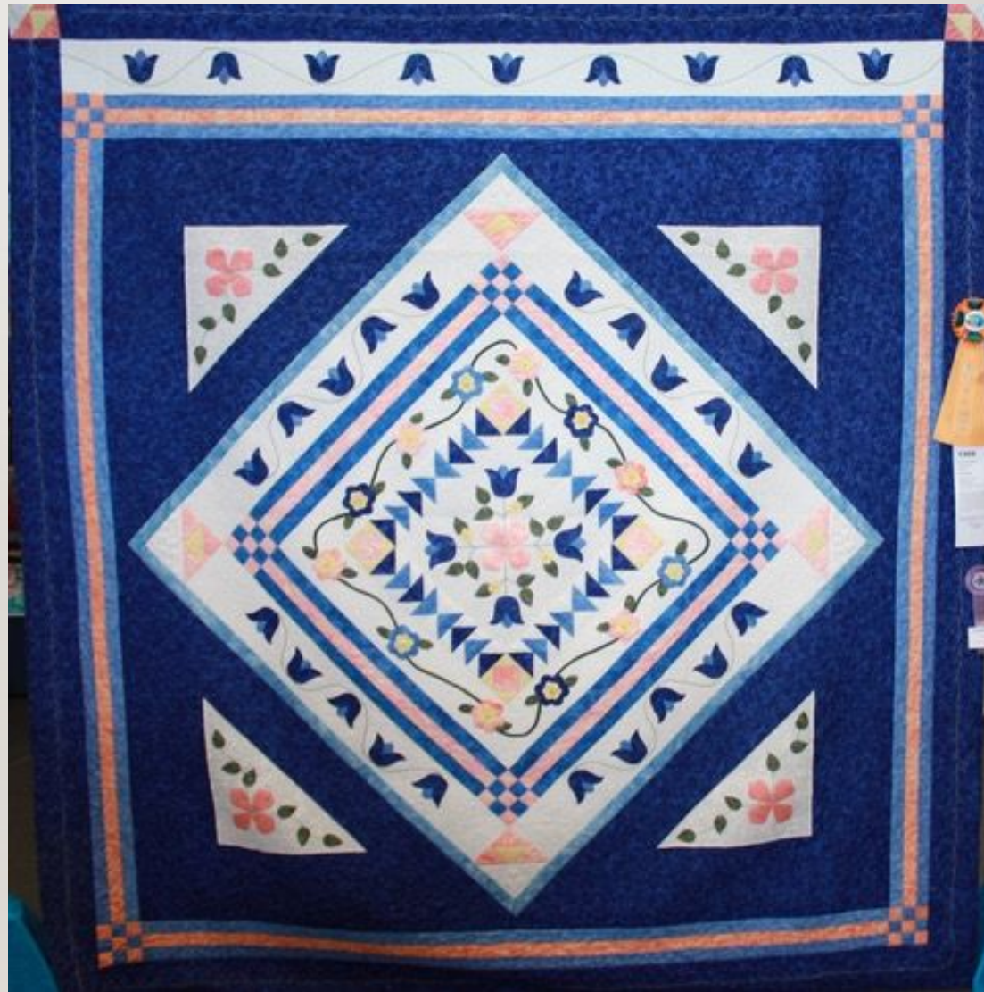
Spring Flowers by Rose Shaw