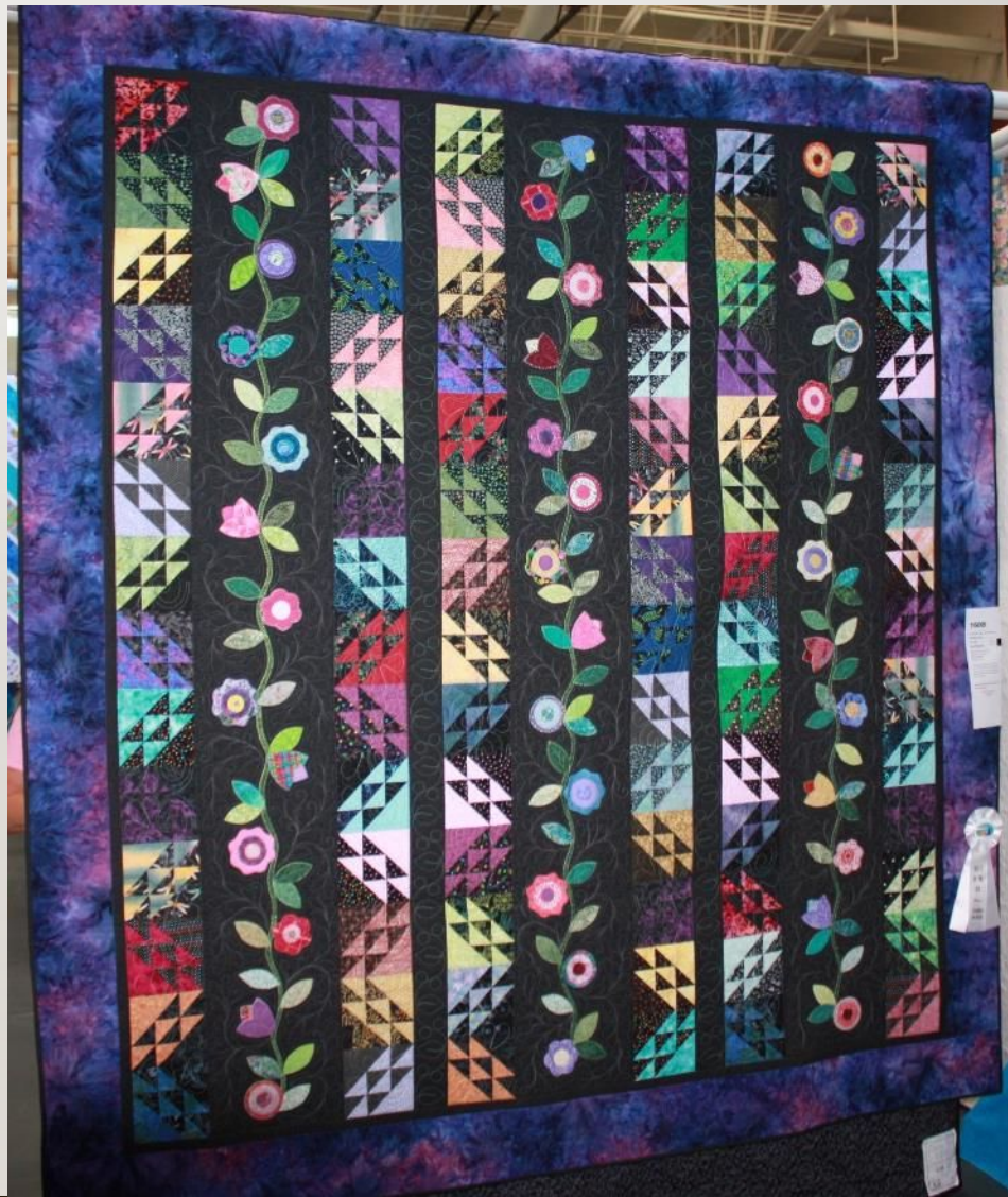
Midnight Garden by Gail Chipman