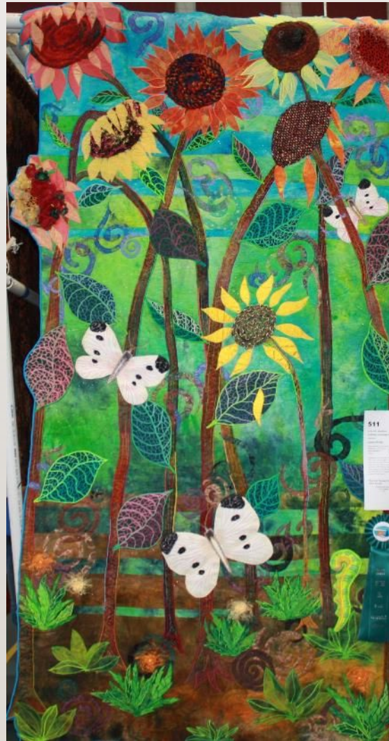
Sunflowers & Cabbage Whites by Lauren Strach