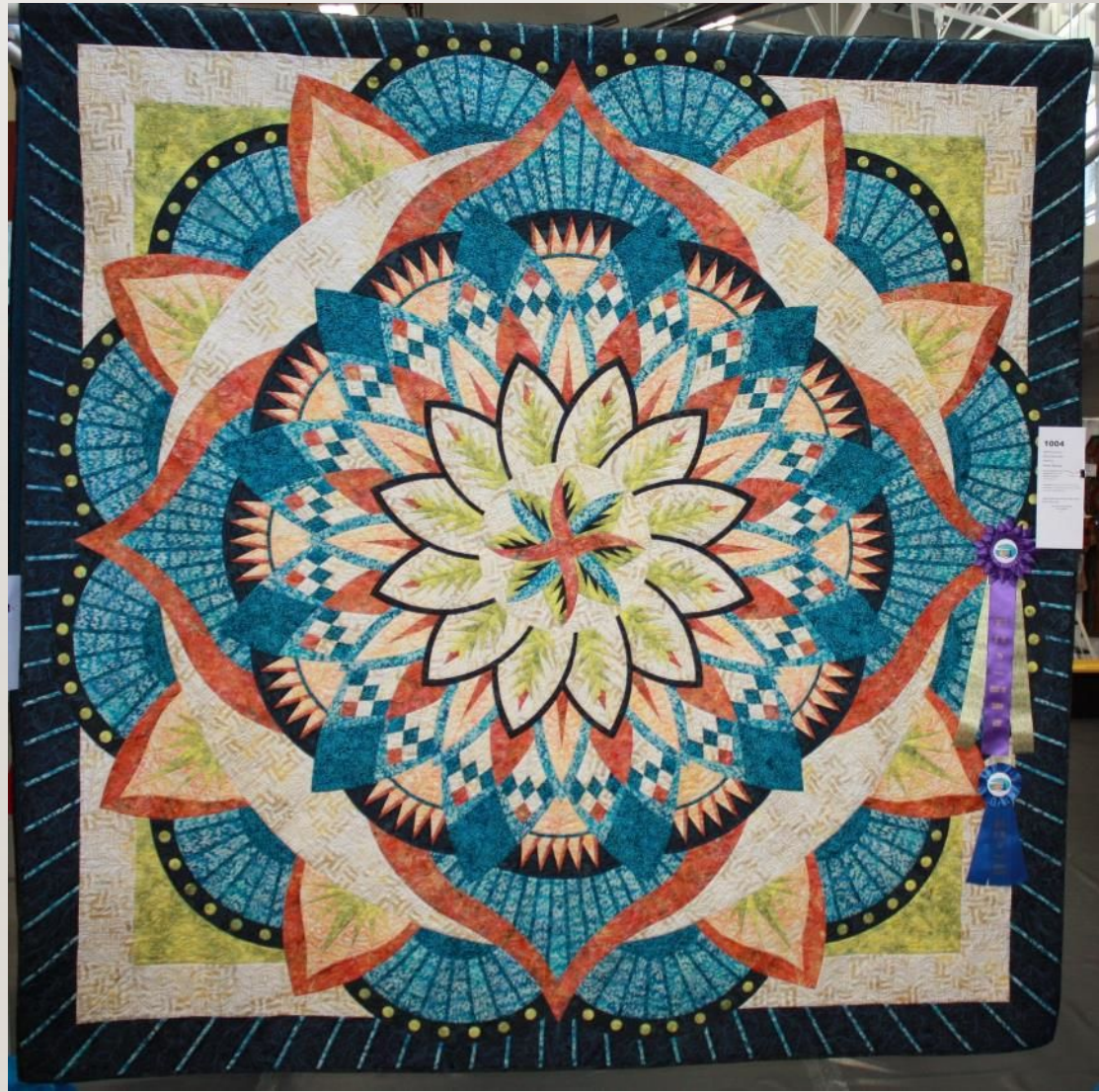
Dinner Plate Dahlia