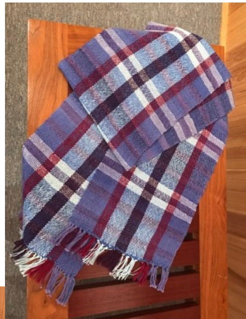
Exhibit by Latimer Weavers